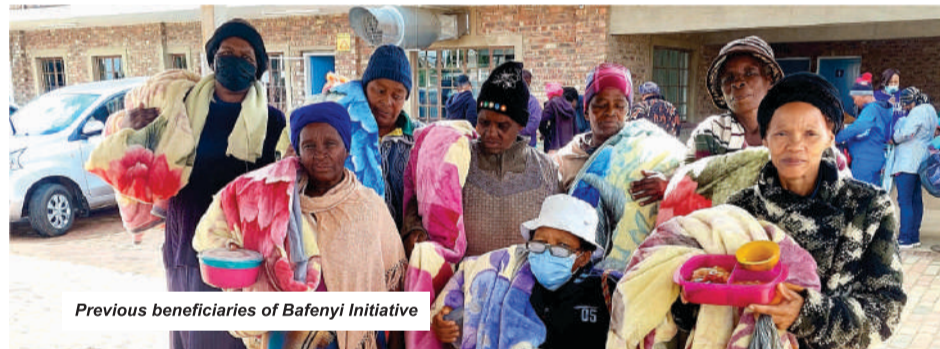
Previous beneficiaries of Bafenyi Initiative